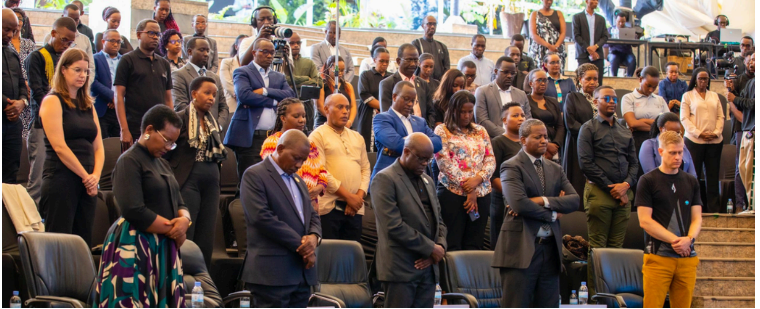
RCSP, its members and partners commemorated the 1994 Genocide Against the Tutsi