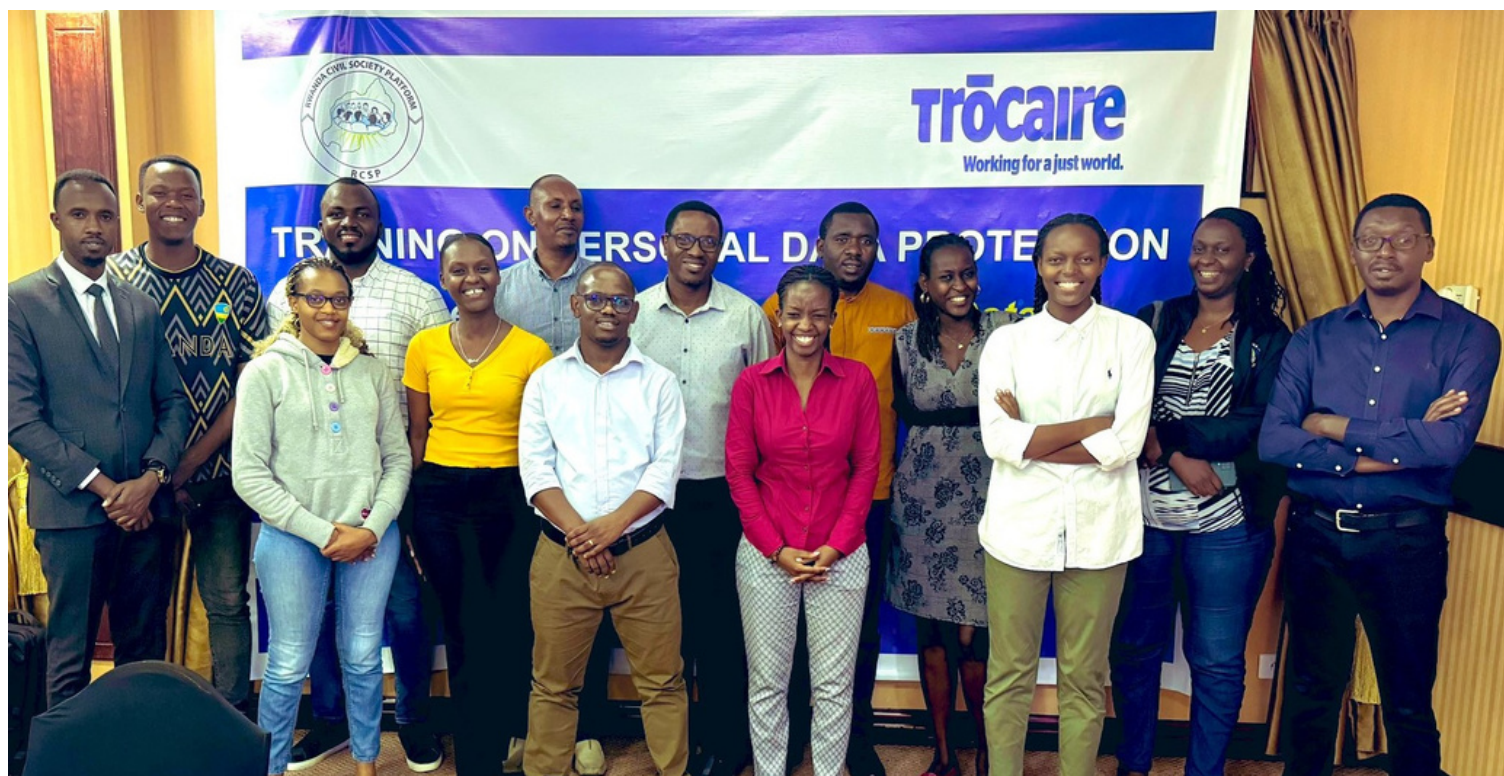
RCSP empowers its members to comply with Data Protection law