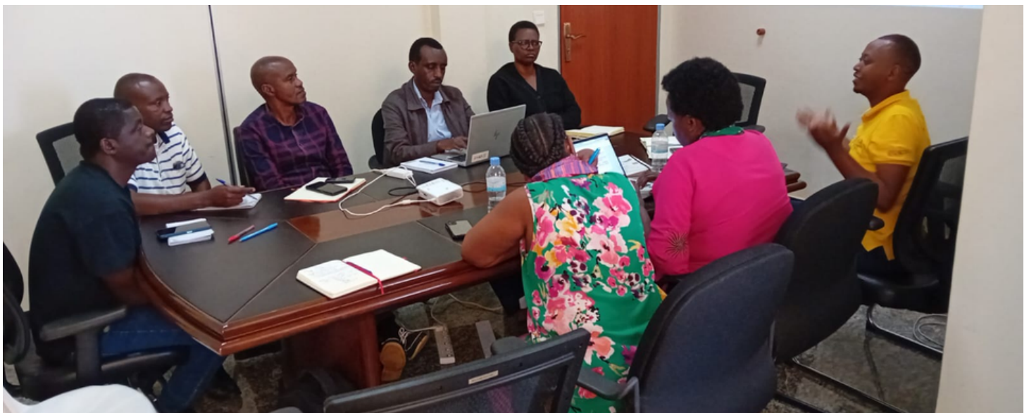
Citizen participation in Imihigo planning process and the competition