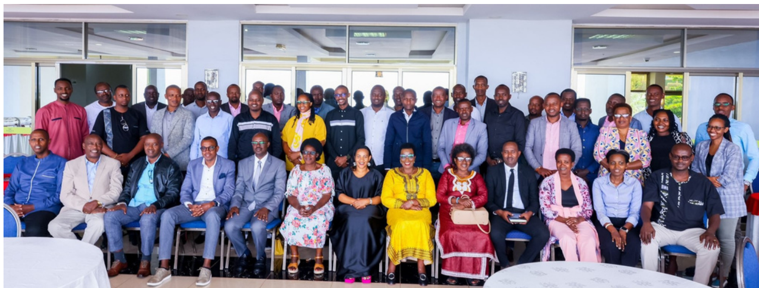
IBUKA General Assembly discussed the preparation of the 30th Commemoration of the 1994 Genocide Against the Tutsi