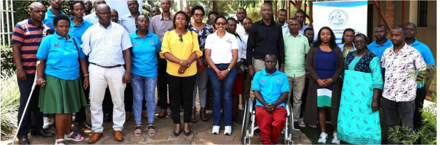
NUDOR and USAID Hanga Akazi launched a bee-keeping project to change the lives of youth with disabilities