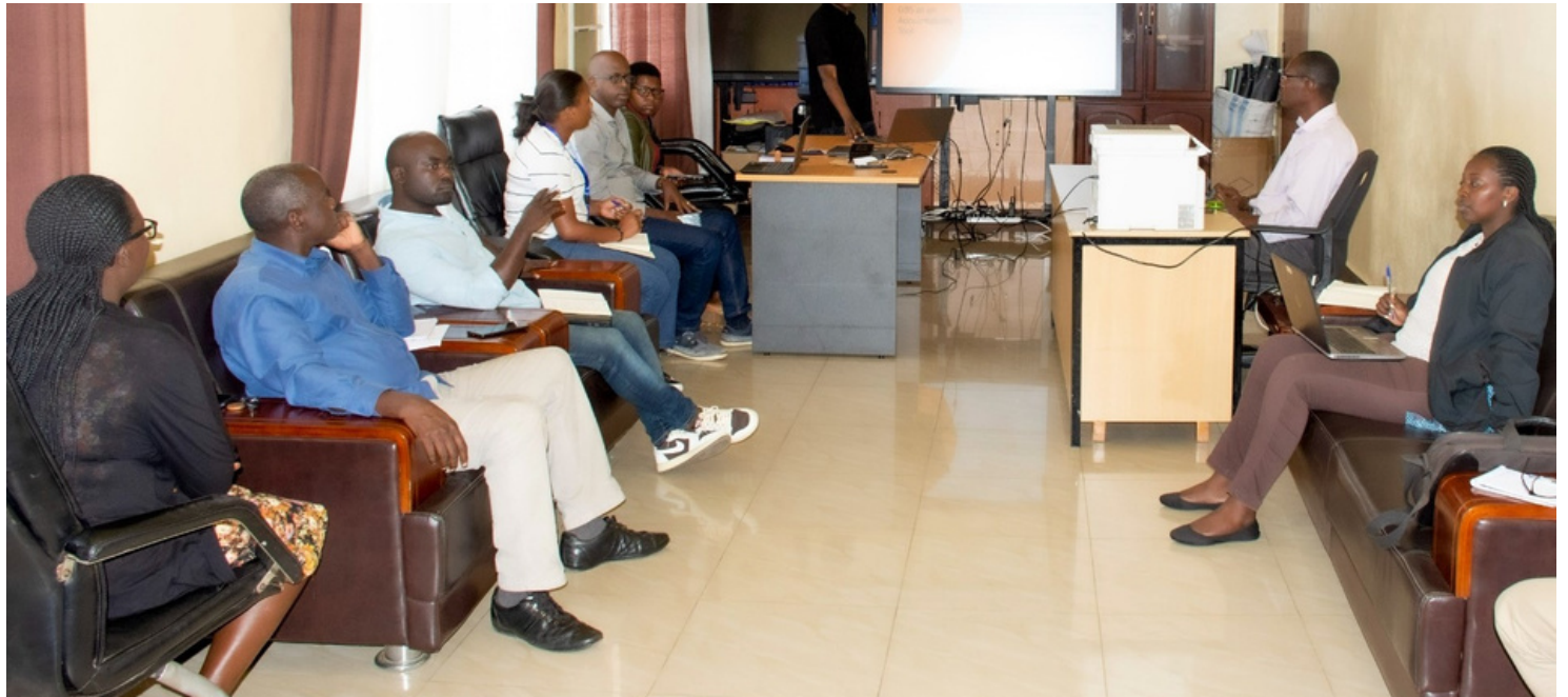
RCSP and GMO collaborated to improve the quality and relevance of districts' 2024/2025 GBS

In the first quarter of 2024, the Rwanda Civil Society Platform (RCSP) partnered with the Gender Monitoring Office (GMO) to conduct a series of district tours aimed at monitoring, coaching, and supporting local authorities in the development and implementation of Gender Budget Statements (GBS). This initiative also involved analyzing the relevance and quality of GBS for the fiscal year 2024 – 2025.