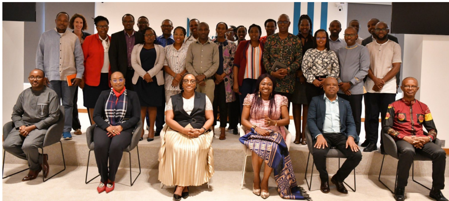
RCSP participated in the pre-annual CSW68 consultative meeting in Rwanda