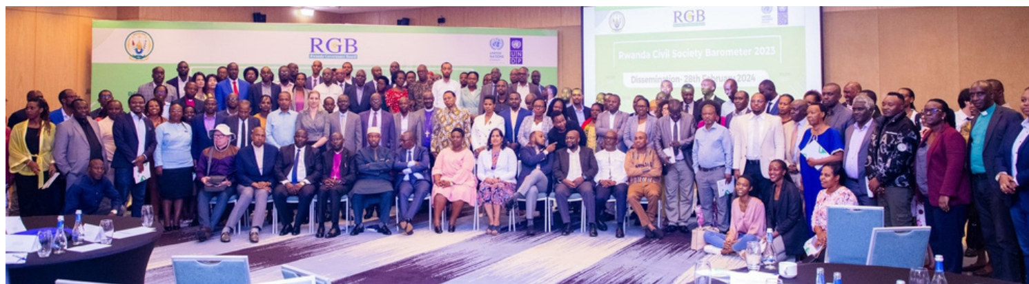
The Fourth Edition of the Rwanda Civil Society Barometer Unveiled