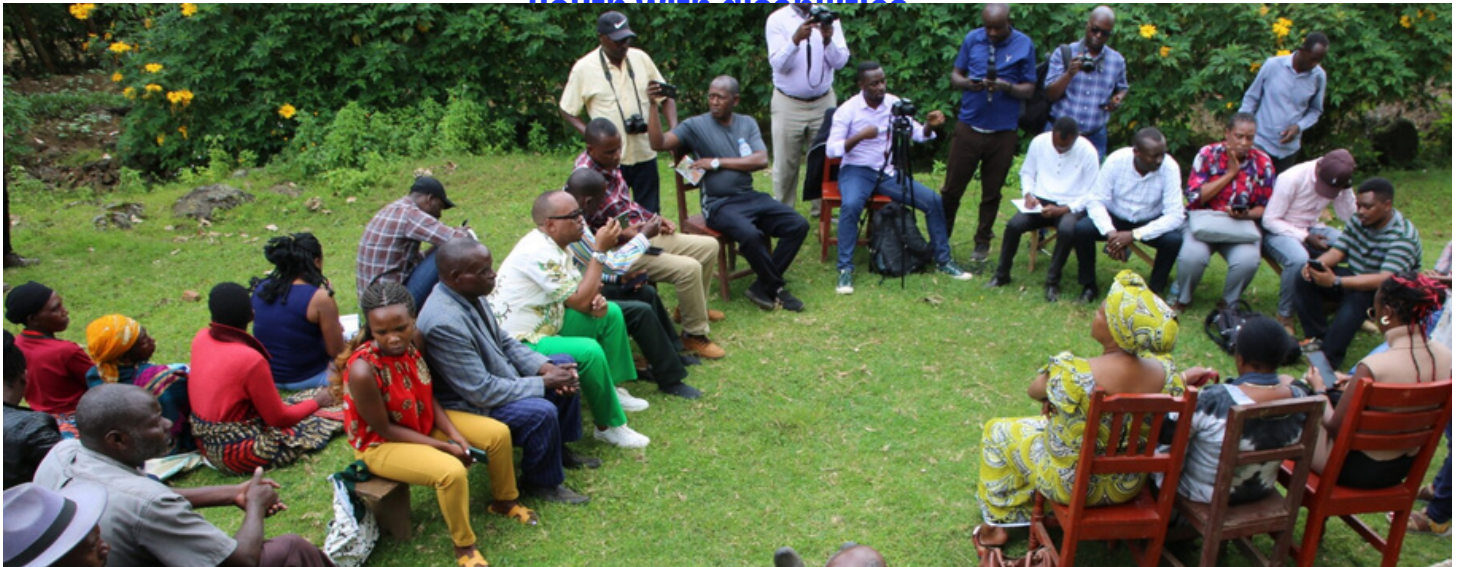
Media urged to report cautiously about HIV/AIDS & strive to combat stigma