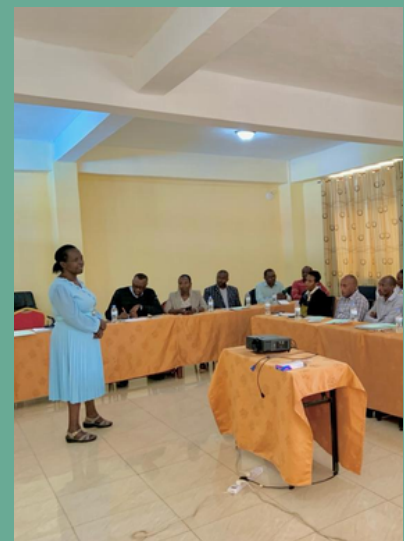
NUDOR conducted a training on Disability Rights, Mainstreaming, and Inclusion